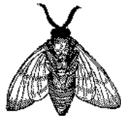
Figure 2: A sample black and white graphic that has been resized with the \includegraphics command.

the environment with figure* , not figure !