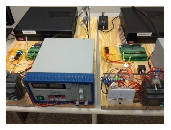
Figure 2. Volttron Demonstration testbed