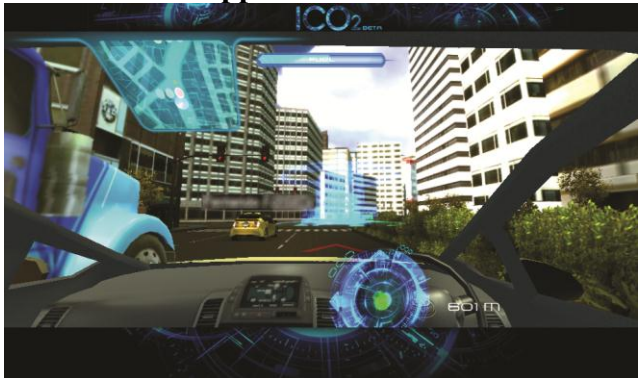
Figure 1. A screenshot of the iCO2 application on Facebook. The blue "wheel" (mid-right) is the driving interface. It shows "green" to indicate eco-friendly driving behavior

iCO_2 is an online tool for practicing eco-safe driving with multiple networked users. In September 2012, iCO_2 was launched as an application on Facebook.<sup>1</sup> The 3D scenario depicts an area in Tokyo of about 1 km<sup>2</sup>. Users can control the direction and speed of the car operating a mouse-based interface (see Figure 1). The interface will change its color to indicate eco-friendliness in a continuous color range from green (eco-friendly) to red (eco-unfriendly), based on the EMIT emission model [4]. As a first approximation, eco-friendliness is defined by smooth acceleration and deceleration only.