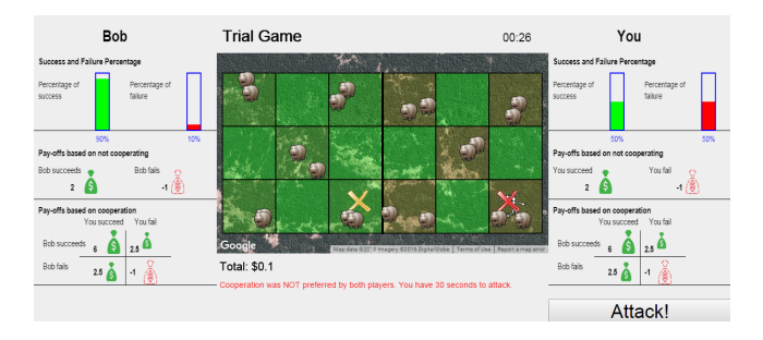
Figure 1: Hunters vs Rangers game interface

decisions about: i)whether they are inclined to cooperate with the other player or not and ii)which region of the park to put their snare (trap) where there is less chance of getting caught and also a high chance of capturing a hippopotamus. So the human subjects may decide to attack "individually and independently" or attack "cooperatively" with the other