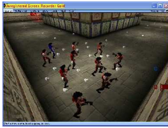
Figure 2: Soar agents in the GameBots environment.

operator that would minimize the difference. Then, a set of preference rules is triggered that ranks the proposals based on feature weight. Additional rules prefer the most similar agent (that is still not sufficiently similar). Thus at the end, only one SCT operator is supported.