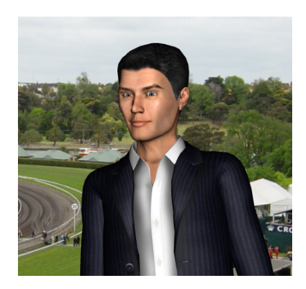
Figure 3: The Charamel character "Paul"

The Paul model (Figure 3) supports over three hundred different gestures, ranging from pointing and waving gestures to more complex gesture sets such as "more or less", "speaking" or "waiting".