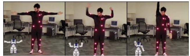
Figure 2: A sample training session using our humanoid, the Aldebaran Nao

Also, we tested generation of cyclical open-loop gaits using the AIBO. A majority of the subjects exhibited dramatic improvement in walk speed over the course of their training session. The fastest walk achieved a velocity of 18.8 cm/s, and the subject had only trained for 17 minutes before achieving this speed. To put this number in context, some of the fastest AIBO walks found through optimization algorithms are in excess of 34 cm/s[5], while the standard walk Sony included with the AIBO is 3.2cm/s. However, most parameter optimization techniques start with a decent hand-coded walk – MARIONET starts from scratch. It should be noted that the output of the MARIONET learning could be used as the starting point for these optimizations. A video of MARIONET in action can be found at www.cs.utexas.edu/~AustinVilla/?p=research/marionet .