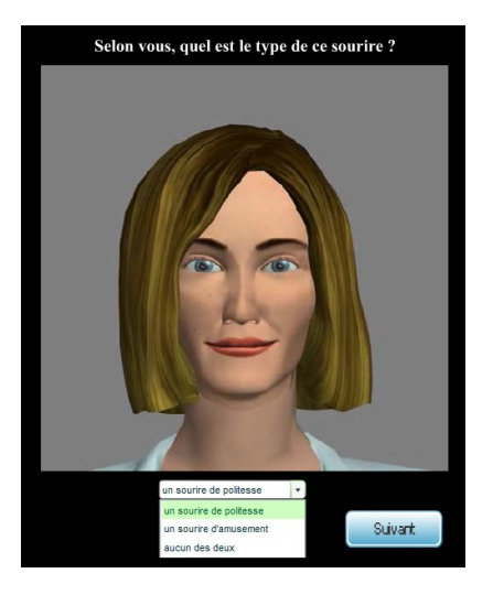
Figure 2: Screenshot of the second part of the test

In the second part of the test, four videos of the virtual character smiling were presented to the user. Here, the virtual character just smiles without speaking. For each video, we asked the user to indicate the types of smile displayed by the virtual character: polite, amused, none of them (Figure 2). In this way, we verify if the smiles are perceived by the users as expected. Once again, the order of the presented videos was counterbalanced to avoid an effect of their order on the results.