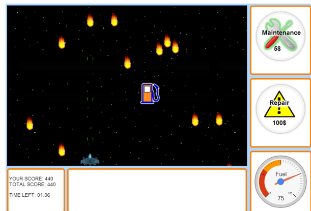
Figure 1: A screen-shot of the spaceship game in progress.

Appears in: Proceedings of the 14th International Conference on Autonomous Agents and Multiagent Systems (AAMAS 2015) , Bordini, Elkind, Weiss, Yolum (eds.), May 4–8, 2015, Istanbul, Turkey. Copyright © 2015, International Foundation for Autonomous Agents and Multiagent Systems (www.ifaamas.org). All rights reserved.